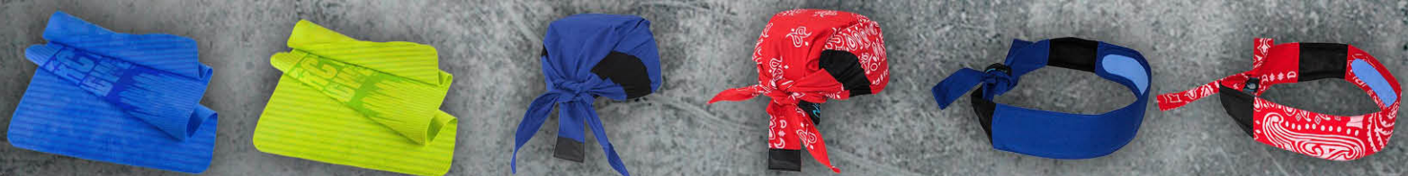
COOLING TOWELS – COOLING HEADSHADES – COOLING HEADBANDS